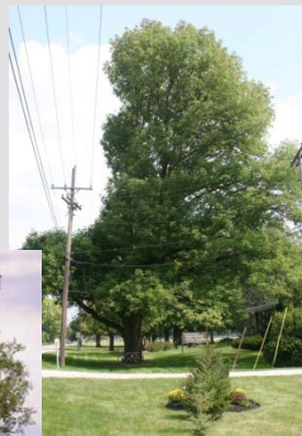
This ash tree is not planted on the right site. It will require maintenance to keep it clear of power lines.