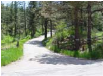
Unger Mountain Road

At MM 114.5 there is a drive with 1 residence at the end. There is no place to turn around, but a type 6 could back up this driveway.