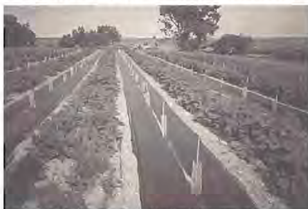
Weed barrier installed with tree guards

Weed barrier fabric works by preventing germinating weed seed shoots from penetrating from below. Weed seeds can germinate on top of the fabric (a common problem when fabric is covered with excessive soil) and send roots through it as they do on a very rocky site. Therefore, we recommend keeping soil off the fabric except at the edges.