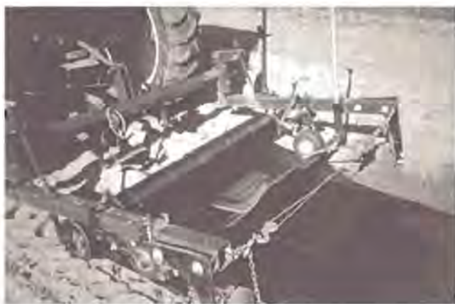
Weed Barrier Fabric Machine

An alternative method of weed control, as well as a method of conserving soil moisture, is the use of weed barrier fabric . This woven polypropylene fabric is placed over planted seedlings, X slits are then cut into the fabric, and the seedlings are pulled through. The fabric we sell is resistant to breakdown caused by ultra-violet radiation and is guaranteed for five years (uncovered)! However, the fabric also traps heat, and should therefore be secured close to the ground to allow heat to escape, as well as prevent it from blowing away. The easiest way to accomplish this is to bury the fabric edges just a few inches deep in the soil. Weed barrier fabric applicators (available for rent) install rolls of fabric over the planting (700 to 900 feet per hour) and plow soil over the edges to keep the fabric low to the ground, all in one operation.