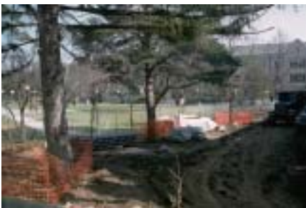
Figure 4: Construction vehicles can damage the existing soil structure by compressing soil particles.

It is easier to avoid soil compaction than to correct it. Keep construction traffic and material storage away from tree root areas. Mulch with 4 to 6 inches of wood chips around all protected trees to help reduce compaction from vehicles that inadvertently cross the barricades.