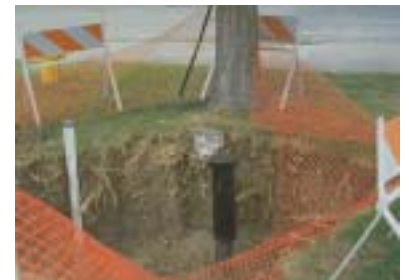
Figure 1: Roots lie in the upper 24 inches of soil and are easily damaged.

The root zone extends horizontally from the tree for a distance at least equal to the tree's height. Preserve at least 50 percent of the root system to maintain a healthy tree. During summer construction, trees require adequate water, enough to saturate the soil, every one to two weeks.