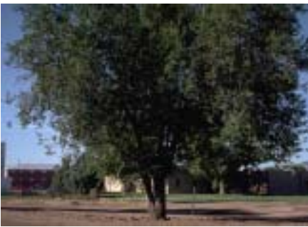
Figure 7: Within two years of adding 12 inches of soil, this tree died.