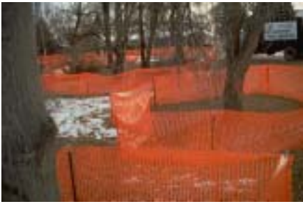
Figure 2: Highly visible tree protection barriers.

Once trees are selected for preservation, include specific preservation methods in the project plans and contracts. All parties should be aware of and agree to the consequences for noncompliance. To ensure compliance, contractors should have tree preservation bonds to cover noncompliance fines. Fines are based on species, tree value, and the amount and type of damage done. These bonds create an additional incentive for compliance.