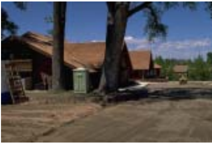
Figure 5: Surface grading severs many roots.