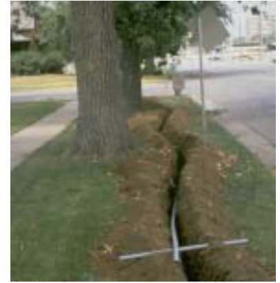
Figure 6: Trenching near trees can severely damage root systems.

To protect the tree, terrace the grade (Figure 9) or build a retaining wall between the tree and the lower grade. Walls should encompass an area extending at least to the drip line.