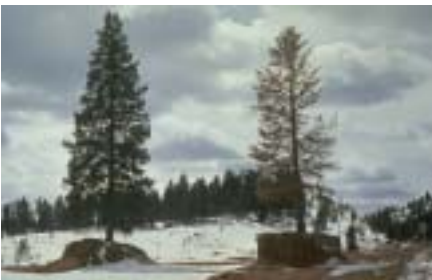
Figure 8: Lowering the grade severs roots and kills trees.