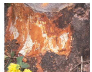
Figure 3: White fungal fans of Armillaria spp.

Armillaria spreads along roots and by rhizomorphs (fungal-root-like structures). One tree or a group can be attacked. The fungus can subsist on dead, woody material for more than 35 years. Armillaria prefers to infect trees that are already stressed by environmental factors or other pathogens. It prefers moist sites and moderate temperatures and is rarely found on extremely hot, cold or dry sites.