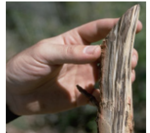
Figure 1: Vertical staining from black stain root disease.

This vascular disease causes extensive black staining of the sapwood in the root and lower stem before killing the sapwood. Bark beetles tend to follow as secondary pathogens and eventually cause the death of the tree. Spread occurs through root grafts and root contacts, and by insects that carry the spores (reproductive structures of the disease). Affected trees usually are in a group.