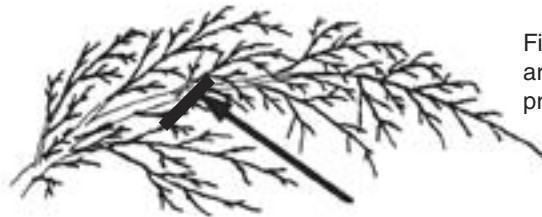
Figure 4. Pruning junipers and arborvitae back to a side shoot hides the pruning cut.

While shearing is quick and easy, it is not recommended, especially after mid-summer. Shearing creates a dense growth of foliage on the plant’s exterior. This in turn shades out the interior growth and the plant becomes a thin shell of foliage. Frequently sheared plants are more prone to show needle browning and dieback from winter cold and drying winds.