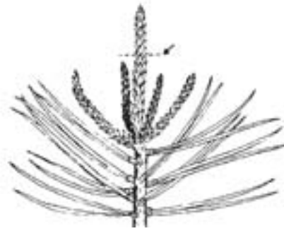
Figure 3. On pines, for bushier new growth pinch growing tips by snapping off 1/3 of the “candle” tips with fingers. Since pines produce few side buds, they are intolerant of more extensive pruning.

While shearing is quick and easy, it is not recommended, especially after mid-summer. Shearing creates a dense growth of foliage on the plant’s exterior. This in turn shades out the interior growth and the plant becomes a thin shell of foliage. Frequently sheared plants are more prone to show needle browning and dieback from winter cold and drying winds.