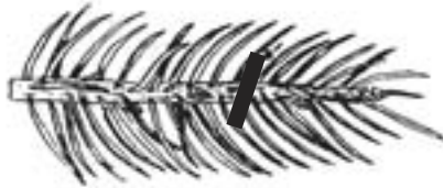
Figure 2. Pruning spruce and fir back to a side bud or side branch will encourage growth of side branches.

Very slow growing species, like the Dwarf Alberta Spruce and Nest Spruce, are rather intolerant of pruning.