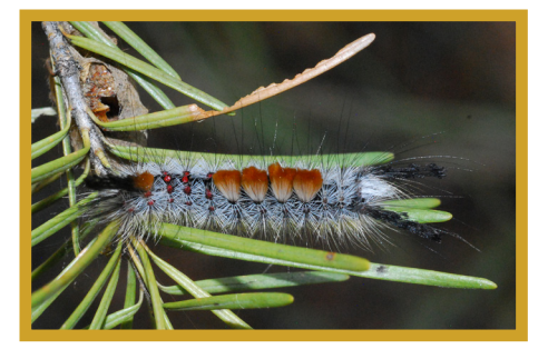
Figure 4. A larva feeding on foliage showing the four cream-colored tufts with the orange-red-colored tops.