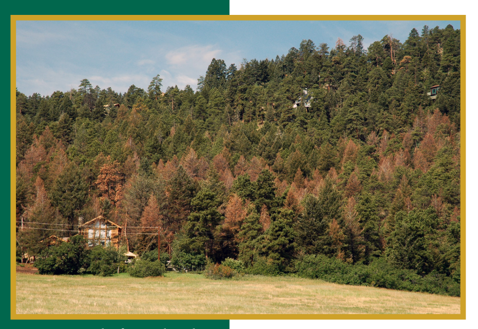
Figure 9. A Douglas-fir tussock moth outbreak in Aspen Park.

early warning that an outbreak may be imminent. Follow-up surveys for the presence of egg masses in winter and early spring, or young larvae shortly after bud-break, provide a further indicator of impending outbreaks.