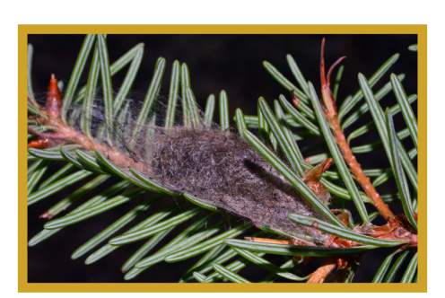
Figure 5. An adult moth will emerge from a pupal case in 10-18 days.