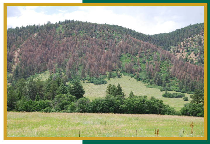
Figure 1. A Douglas-fir tussock moth outbreak in Perry Park, west of Larkspur.

wings, and remain on the pupal case from which they emerged, emitting a pheromone that attracts males; mating occurs shortly after emergence. Adult male moths are gray-brown to dark brown with feathery antennae and a wingspan of about 1 to 1¼ inches. They have gray-brown forewings with cinnamon-brown-colored hind wings. The wingless female moths have small thread-like antennae and a large