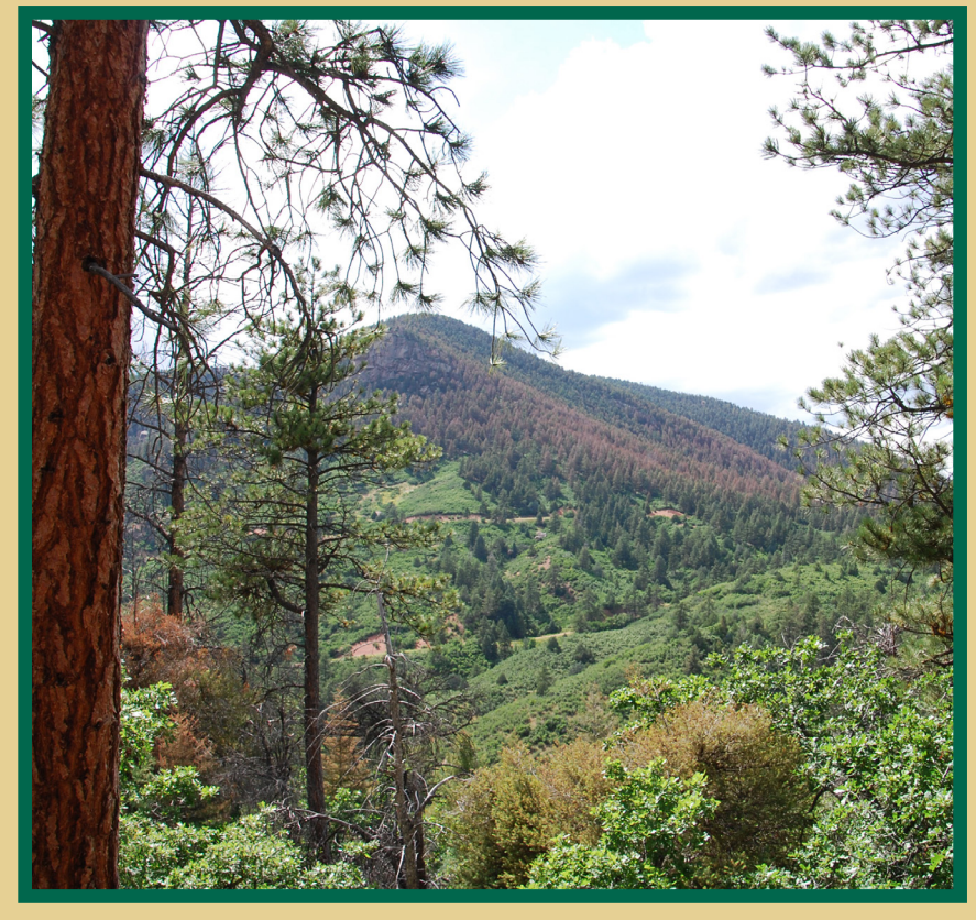
Figure 11. A Douglas-fir tussock moth outbreak in Perry Park.

Colorado's forests provide clean air and water, wildlife habitat, world-class recreational opportunities, wood products and unparalleled scenery. These benefits contribute to quality of life and are vital to state and local economies. Without careful management of forest resources, these assets and community safety are at risk. It is critical to proactively manage forests and for landowners and communities to remain informed about threats to their forests, to ensure healthy, resilient forests for present and future generations.