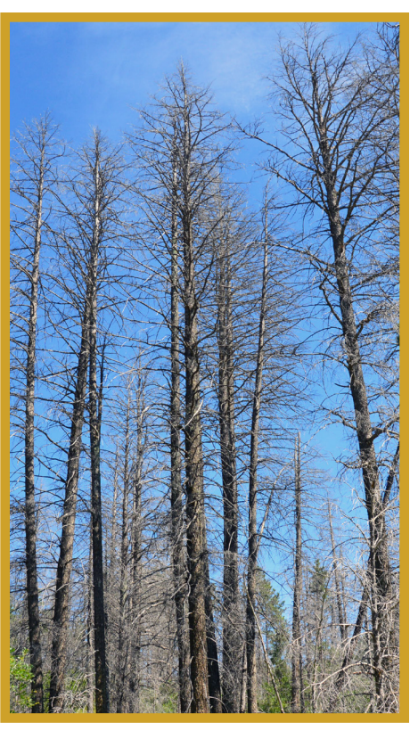
Figure 13. Douglas-fir tussock moth mortality on the Rampart Range.