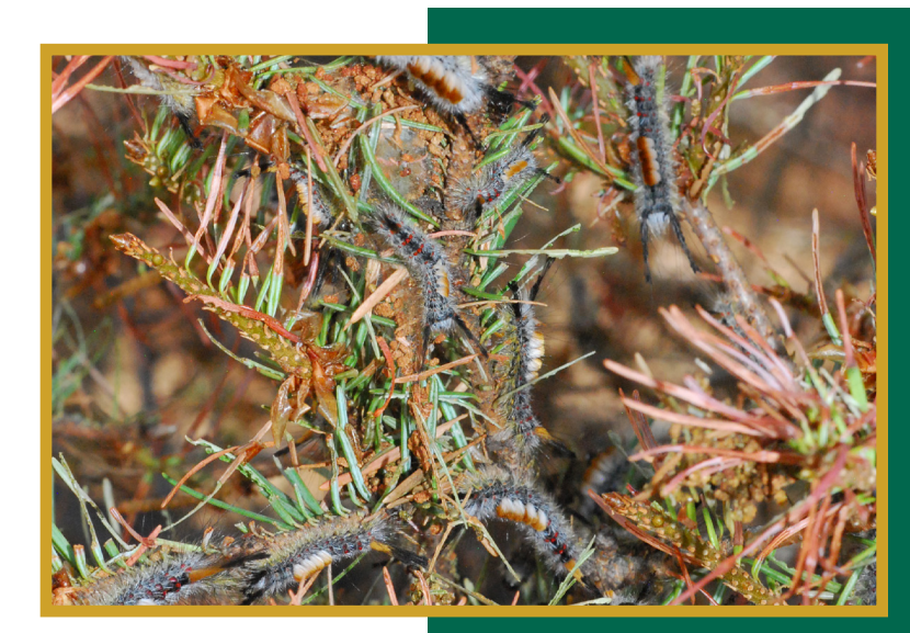
Figure 7. Douglas-fir tussock moth larvae feed on both new and older needles.

both new shoots and older foliage, western spruce budworm larvae restrict their feeding to expanding buds and current year's foliage. Also, Douglas-fir tussock moth doesn't produce silken webbing on trees, a common characteristic of western spruce budworm.