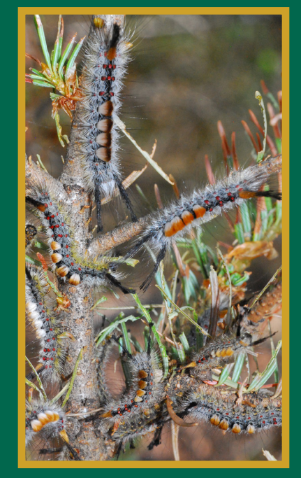
Figure 8. There are slight color variations in the four tussocks on top of the Douglas-fir tussock moth larvae.

Use of traps baited with the Douglas-fir tussock moth female sex pheromone can be purchased through retail vendors and deployed in areas suspected of infestation, or areas which have had a history of outbreak populations, to predict looming outbreaks. Trap catches of 25 or more male moths provide an