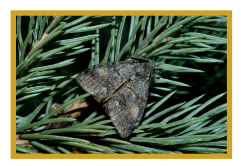
Figure 2. An adult male Douglas-fir tussock moth.

Douglas-fir tussock moths produce one generation per year. Peak adult activity is in July and August, but may continue until November. Male moths, which can be seen flying, are most active around midday. Females do not have functional