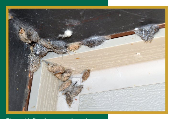
Figure 10. Pupal cases on a home in Boulder.

In forested areas, aerial application of insecticides by either helicopter or fixed-wing aircraft is an effective, efficient treatment for Douglas-fir tussock moth, but should only be considered at the local level. Aerial treatment options include use of the bacterial insecticide Bacillus thuringiensis (Dipel, Foray), the insect growth regulators diflubenzuron (Dimilin) or tebufenozide (Confirm, Mimic) or Carbaryl (Sevin, Sevimol). Aerial applications of insecticides over forested areas pose a risk of danger to non-target organisms, including aquatic insects, fish and/or organisms that may be rare or endangered. These factors should be taken into consideration when considering aerial spray operations for this native insect.