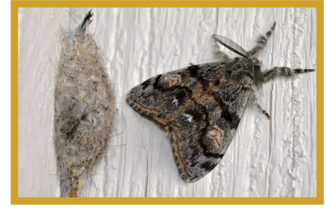
Figure 6. A pupal case and an adult male moth.