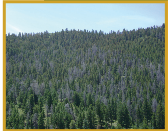
Figure 1. Tree mortality from western spruce budworm in Grand County.

Mature larvae tie the tips of twigs or foliage together with silk and pupate on the branch tips or elsewhere on the tree. Pupae are about ½-inch (13 mm) long and yellow-brown in color when first formed, later turning to red-brown. Pupation lasts about 10-15 days, followed by emergence of the adult moths.