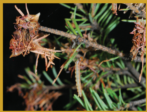
Figure 6. A larva ballooning on a strand of silk with associated severe defoliation.

Adult moths are about ½-inch (13 mm) long, with a wingspan of approximately 1 inch (22-28 mm). Both sexes are similar in appearance, although females may be slightly larger. The wings are variable in color, ranging from gray to orange-brown; they also may be banded or streaked, and some individuals may have a conspicuous white dot on the wing margin.