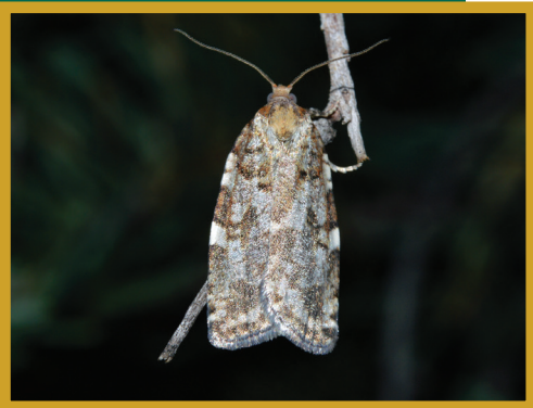
Figure 5. An adult moth.