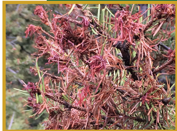
Figure 2. Discoloration from larvae feeding on new foliage.

This Quick Guide was produced by the Colorado State Forest Service to promote knowledge transfer.