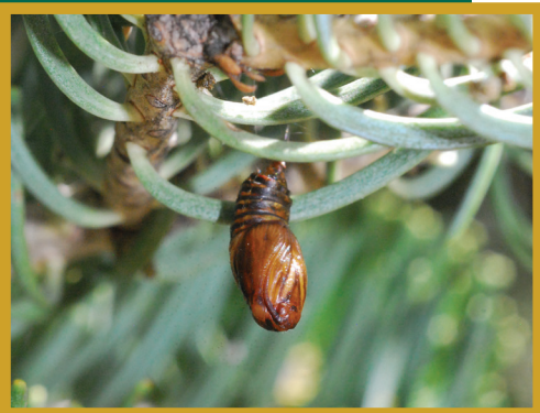
Figure 4. A western spruce budworm pupa.