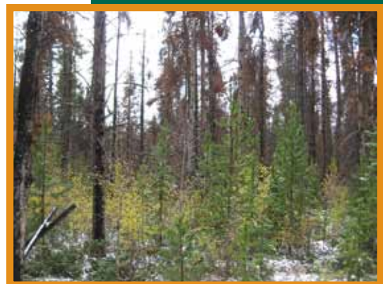
Figure 23: A young lodgepole pine stand. Thinning lodgepole pines early on in their lives will help reduce the wildfire hazard in the future.