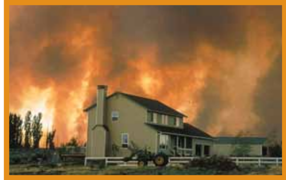
Figure 1: Firefighters will do their best to protect homes, but ultimately it is the homeowner's responsibility to plan ahead and take actions to reduce fire hazards around structures.

In this guide, you'll read about steps you can take to protect your property from wildfire. These steps focus on beginning work closest to your house and moving outward. Also, remember that keeping your home safe is not a one-time effort – it requires ongoing maintenance. It may be necessary to perform some actions, such as removing pine needles from gutters and mowing grasses and weeds several times a year, while other actions may only need to be addressed once a year. While