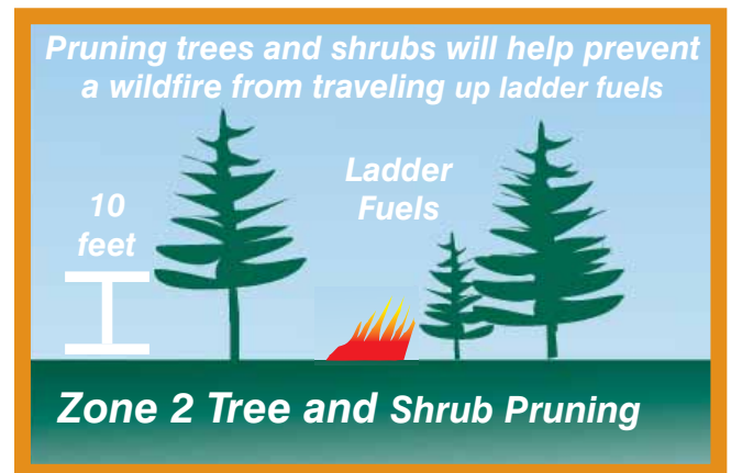
Figure 18: Pruning trees will help prevent a wildfire from climbing from the ground to the tree crowns.