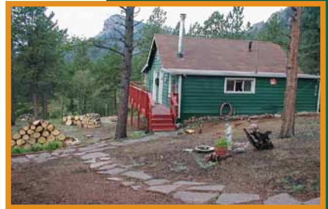
Figure 12: Homesite after creating a defensible space.