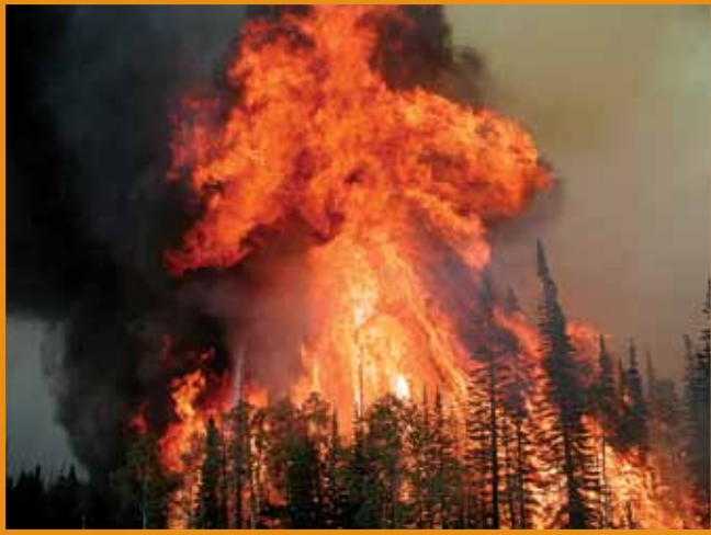
Figure 3: Burning embers can be carried long distances by wind. Embers ignite structures when they land in gaps, crevices and other combustible places around the home.

Heavier fuels, such as brush and trees, produce a more intense fire than light fuels, such as grass. However, grass-fueled fires travel much faster than heavy-fueled fires. Some heavier surface fuels, such as logs and wood chips, are potentially hazardous heavy fuels and also should be addressed.