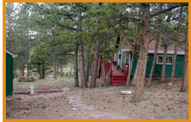
Figure 11: Homesite before defensible space.

Zone 3 is the area farthest from the home. It extends from the edge of Zone 2 to your property boundaries.