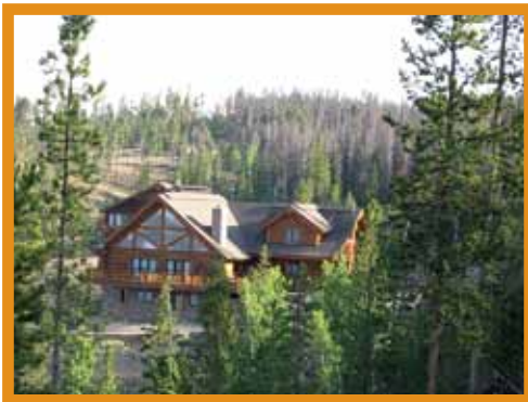
Figure 2: Colorado's grasslands, shrublands, foothills and mountains all have areas in the wildland-urban interface where human development meets wildland vegetative fuels.

landowners must work together to reduce fire hazards within and adjacent to communities. This includes treating individual home sites and common areas within communities, and creating fuelbreaks within and adjoining the community where feasible. This document will focus on actions individual landowners can take to reduce wildfire hazards on their property. For additional information on broader community protection, go to www.csfs.colostate.edu .