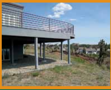
Figure 14: This homeowner worked hard to create a defensible space around the home. Notice that all fuel has been removed within the first 5 feet of the home, which survived the Waldo Canyon Fire in the summer of 2012.

Zone 2 is an area of fuels reduction designed to diminish the intensity of a fire approaching your home. The width of Zone 2 depends on the slope of the ground where the structure is built. Typically, the defensible space in Zone 2 should extend at least 100 feet from all structures. If this distance stretches beyond your property lines, try to work with the adjoining property owners to complete an appropriate defensible space.