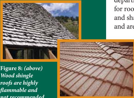
Figure 8: (above) Wood shingle roofs are highly flammable and not recommended.

This guide provides only basic information about structural ignitability. For more information on fire-resistant building designs and materials, refer to the CSFS FireWise Construction: Site Design and Building Materials publication at www.csfs.colostate.edu .