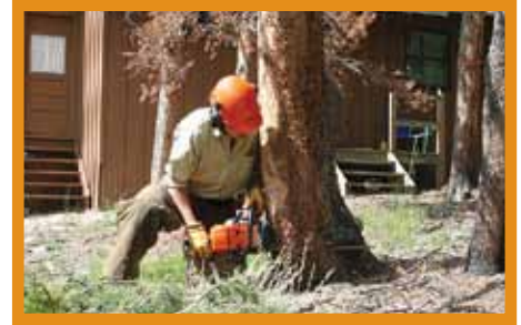
Figure 26: Keeping the forest properly thinned and pruned in a defensible space will reduce the chances of a home burning during a wildfire.