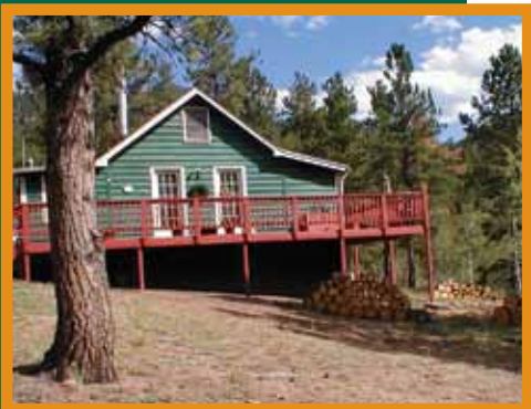
Figure 10: Decks, exterior walls and windows are important areas to examine when addressing structure ignitability.