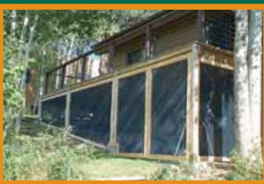
Figure 16: Enclosing decks with metal screens can prevent embers from igniting a house.