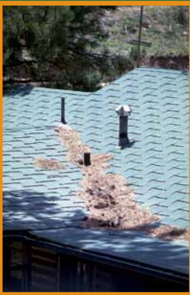
Figure 15: Clearing pine needles and other debris from the roof and gutters is an easy task that should be done at least once a year.