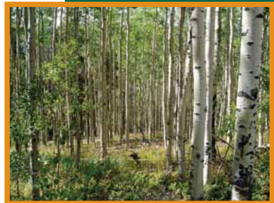
Figure 22: Mature aspen stands can contain many young conifers, dead trees and other organic debris. This can become a fire hazard.