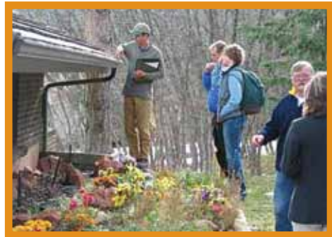
Figure 27: Sharing information and working with your neighbors and community will give your home and surrounding areas a better chance of surviving a wildfire.