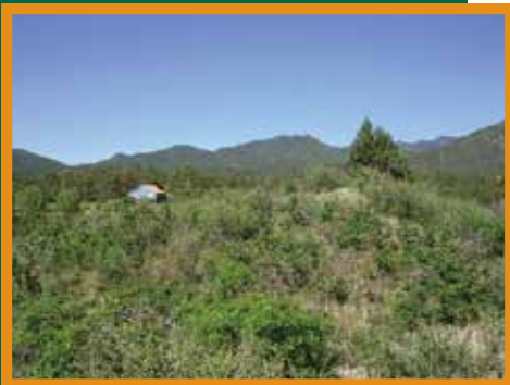
Figure 25: Gambel oak needs to be treated in a defensible space at least every 5-7 years because of its vigorous growing habits.