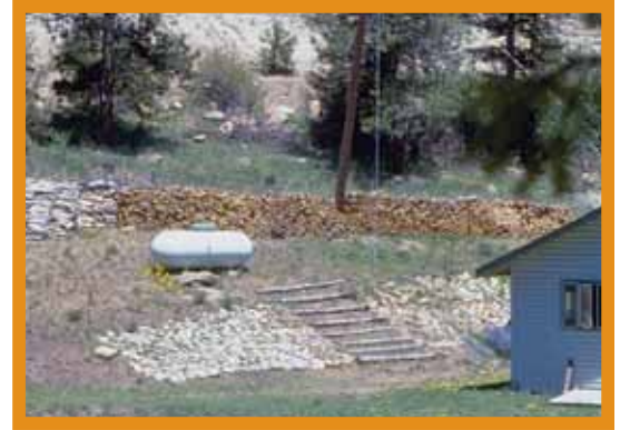
Figure 19: Keep firewood, propane tanks and natural gas meters at least 30 feet away from structures.