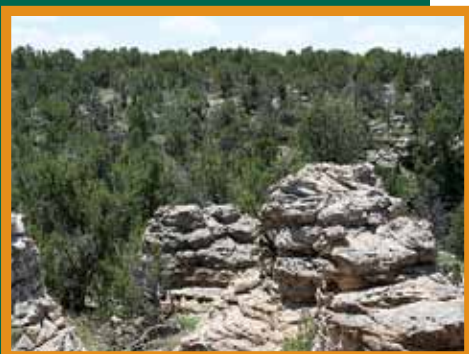
Figure 24: Piñon-juniper forests are often composed of continuous fuels. Creating clumps of trees with large spaces in between clumps will break up the continuity.

Note: This publication does not address high-elevation spruce-fir forests. For information on this forest type, please contact your local CSFS district office.