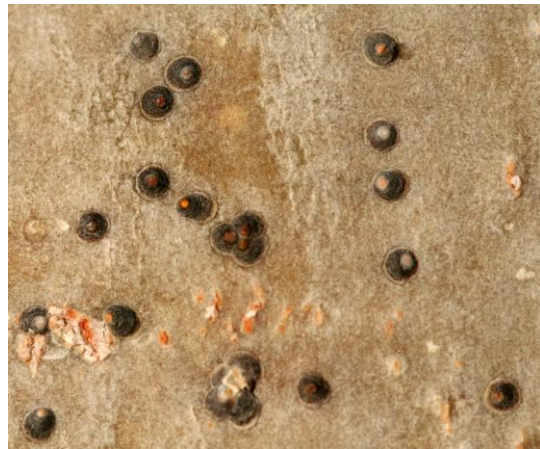
Figure 2. Overwintered Instar II poplar scales on aspen trunk.

Life History and Habits: Poplar scale has been found associated with aspen and narrow-leaf cottonwood in Colorado. Other Populus , along with certain Salix and Tilia , are also reported as hosts. Infestations on aspen typically occur on the trunk and larger branches, which produce a characteristic bubbling symptom on bark. Decline and some death of aspen has been associated with this insect in Colorado with street trees and trees in poor sites particularly susceptible.