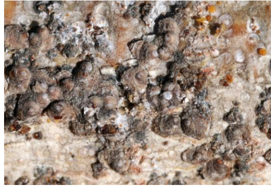
Figure 1. Poplar scales.

Identification and Descriptive Features: The poplar scale has a circular scale cover, approximately 1.7-2.8 mm in diameter. It is gray with an orange-yellow center. Males produce an elongate oval covering and are smaller than females. The exposed body of the female is light yellow.