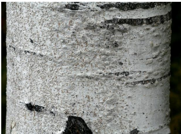
Figures 4, 5. Bark bubbling symptom associated with poplar scale infestation on aspen trunk.