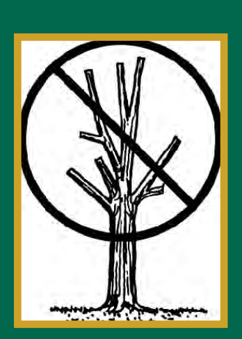
Figure 9: Do not top your trees.