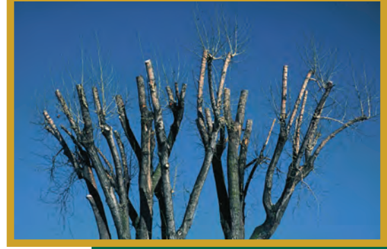
Figure 5: Avoid topping your trees.