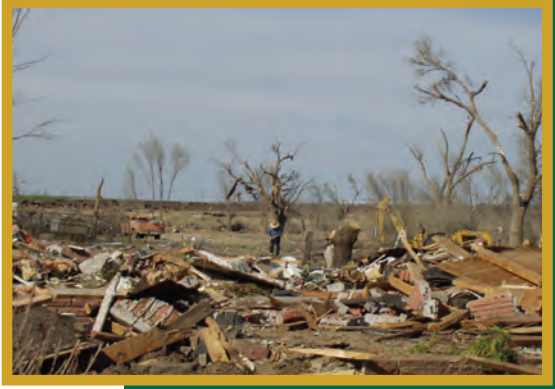
Figure 3: Damage after a tornado.