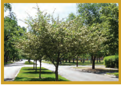
Figure 2: Hawthorn tree (Crataegus spp).

"If a tree is large and the work is off the ground, or if a chainsaw is needed, it's best to contact a qualified arborist," Rosenow adds. "They have the equipment and know how to safely remove broken or downed limbs and to help save and repair trees." If you need professional help, locate a qualified tree care specialist and che