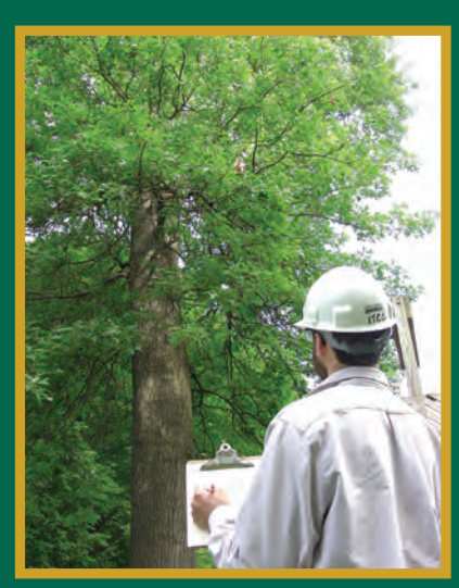
Figure 7: A careful assessment of trees is important before and after a storm.

If a tree has been weakened by disease, there may be little that can be done to prevent major breakage or loss when the stresses of a storm occur. However, there are preventive measures you can take to help strengthen your trees so they are more resistant to storm damage.