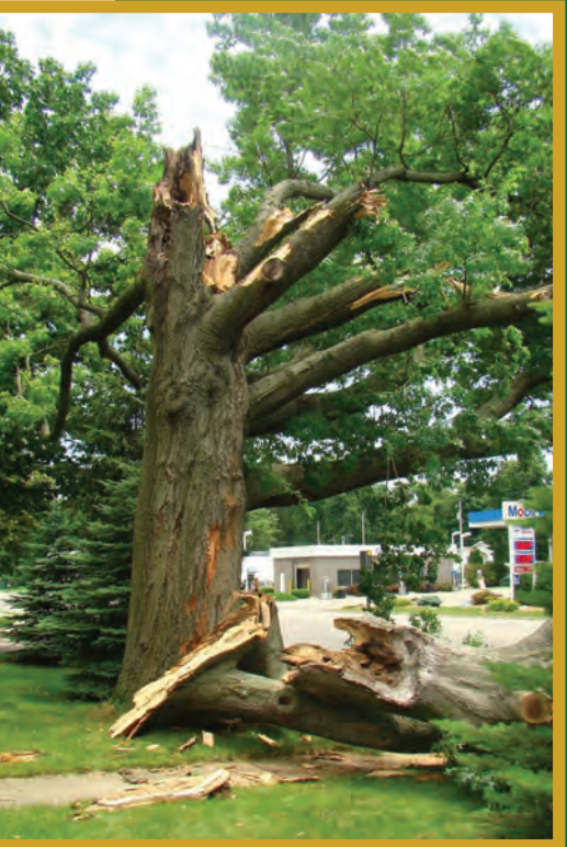
Figure 8: A tree that has lost the leading stem (the main upward-trending branch).