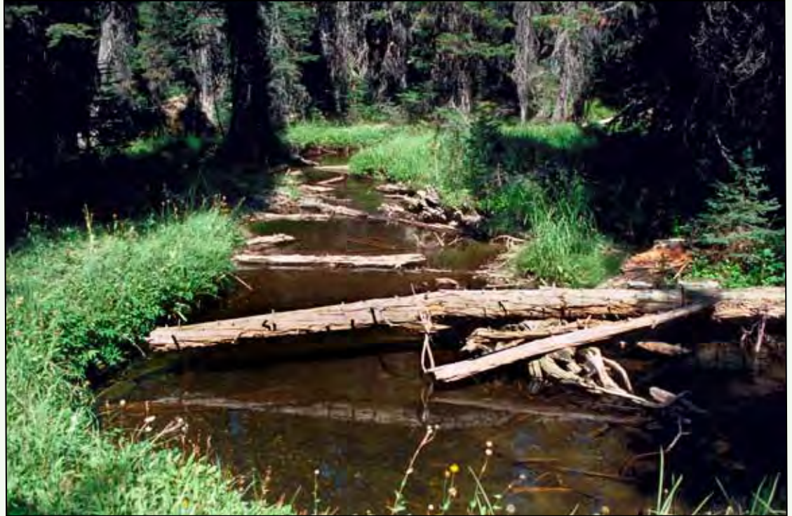
Woody vegetation in Riparian Forest Buffers provides food and cover for wildlife, helps lower water temperatures and slows out-of-bank flood flows.

R iparian Forest Buffers are natural or re-established woodlands next to streams, lakes and wetlands.