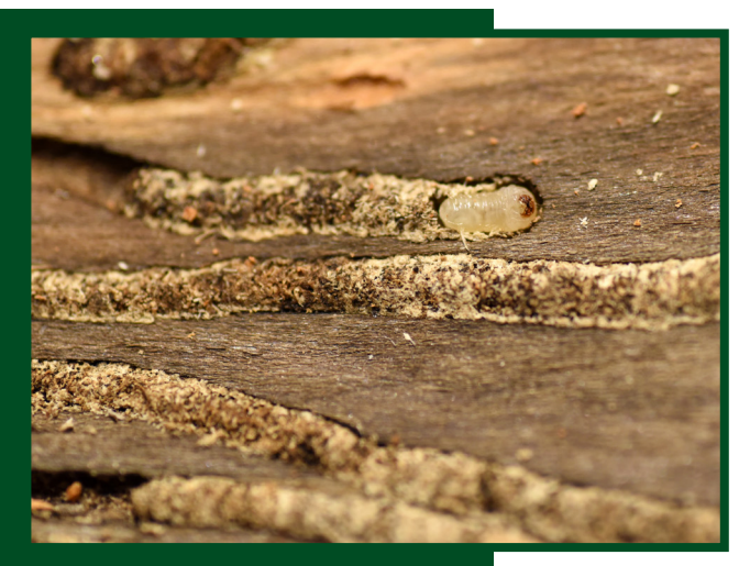
Figure 3 . A fir engraver beetle larva.