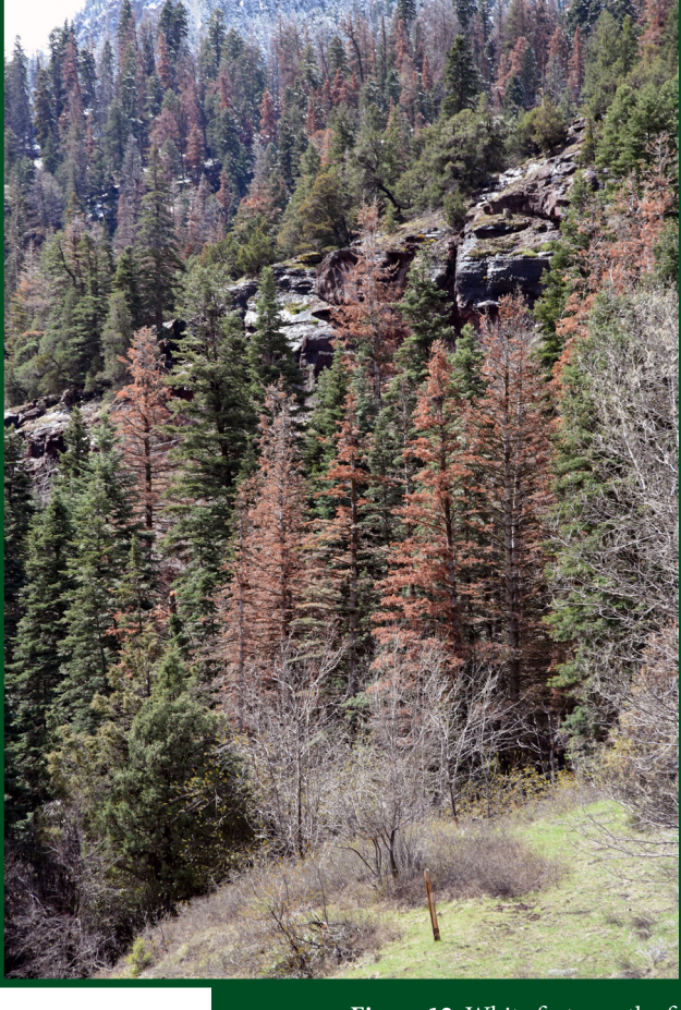
Figure 12 . White fir trees, the fir engraver's only host in the state, in southern Colorado.