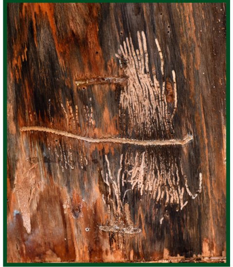
Figure 7. A close-up picture of the gallery pattern.