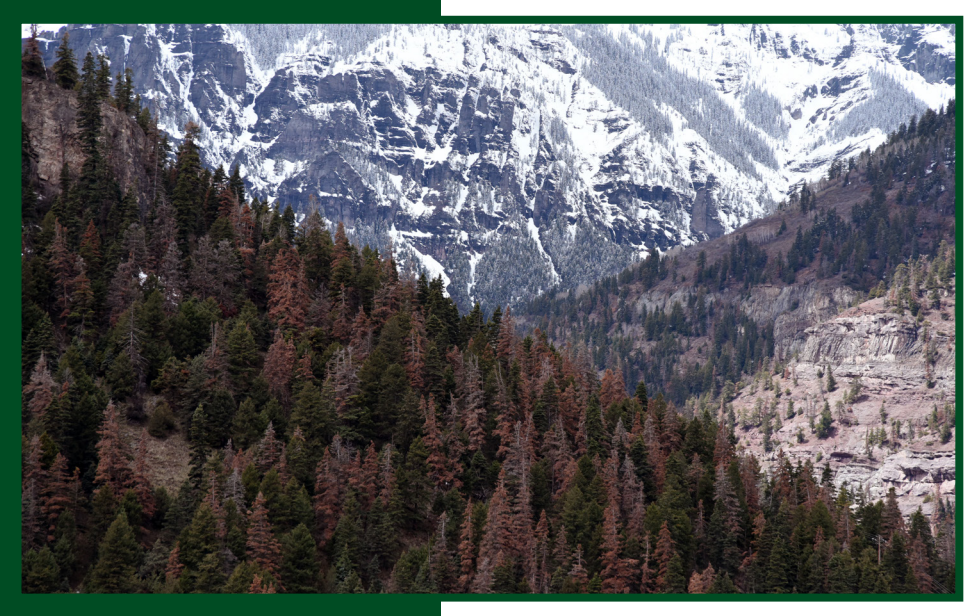
Figure 13. A vista near Ouray, Colo.