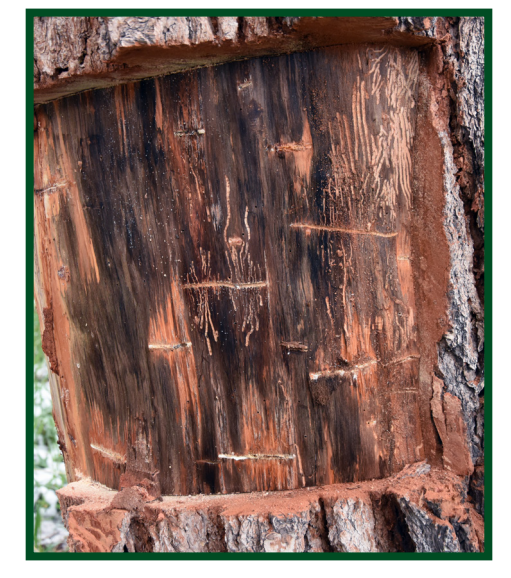
Figure 6. Galleries or tunnels underneath the bark of a tree, with darkened areas of the wood due to associated fungi.