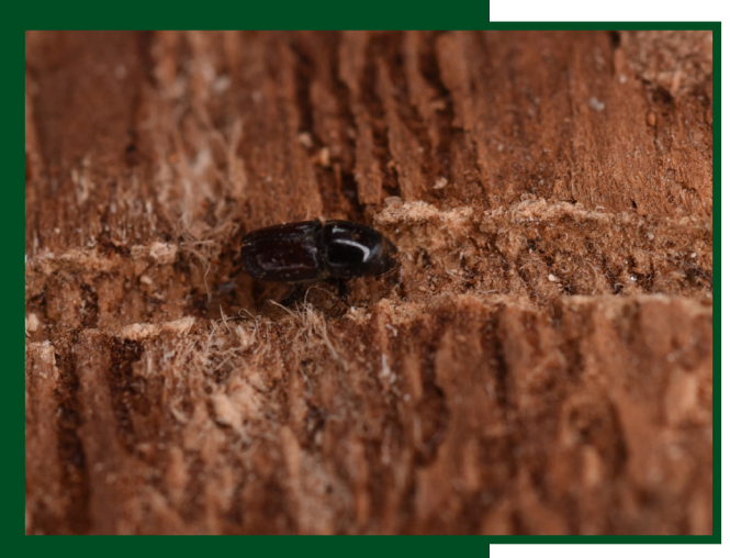
Figure 4 . An adult fir engraver beetle.