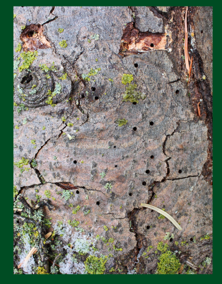
Figure 5. Adult beetle exit holes on a white fir tree.

remain under the bark for another two weeks before emergence. Adults are shiny, dark-brown to black beetles, \frac{1}{6} -inch (4 mm) long, or about the size of a small grain of rice.