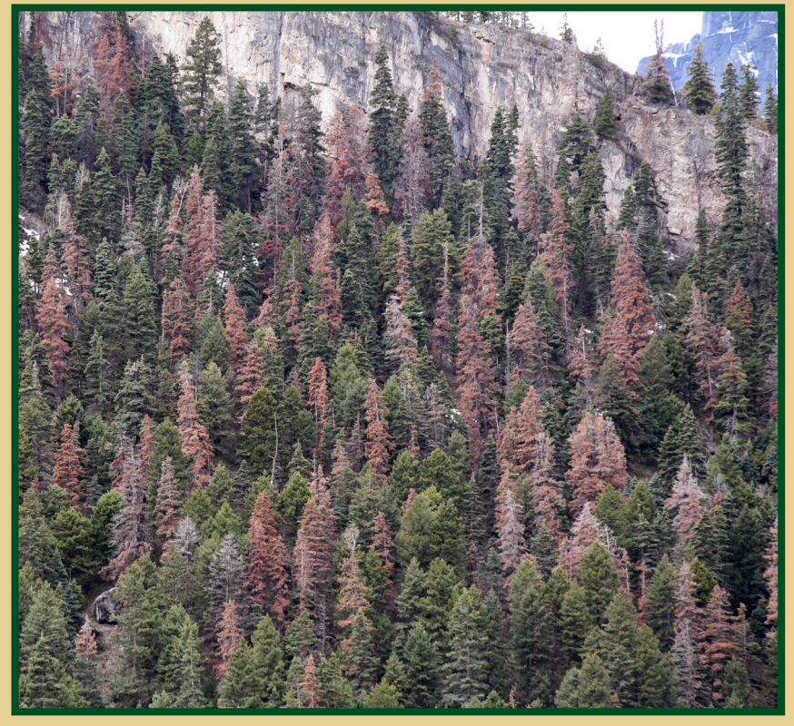
Figure 10. A mixed-conifer forest with fir engraver beetle-killed trees.

Colorado's forests provide clean air and water, wildlife habitat, worldclass recreational opportunities, wood products and unparalleled scenery. These benefits contribute to quality of life and are vital to state and local economies. Without careful management of forest resources, these assets and community safety are at risk. It is critical to proactively manage forests and for landowners and communities to remain informed about threats to their forests, to ensure healthy, resilient forests for present and future generations.