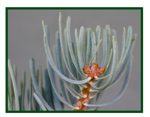
Figure 2. An identifying characteristic of white fir trees is light bluish-green or silver needles that are flat and curve out from the tree.

In Colorado, white fir is the only host tree of fir engraver beetles. White fir is a component of southern Colorado's mixed-conifer forests, where it occurs in