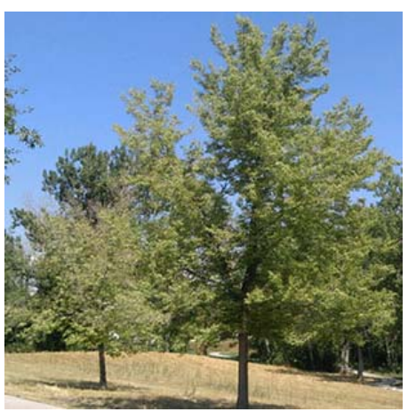
Figure 1: Severely drought-stressed trees were not included in the study.

Over the 24-year study period, more than half the trees were eliminated from the study due to insect and disease issues, insufficient irrigation (see Figure 1), development or other causes.