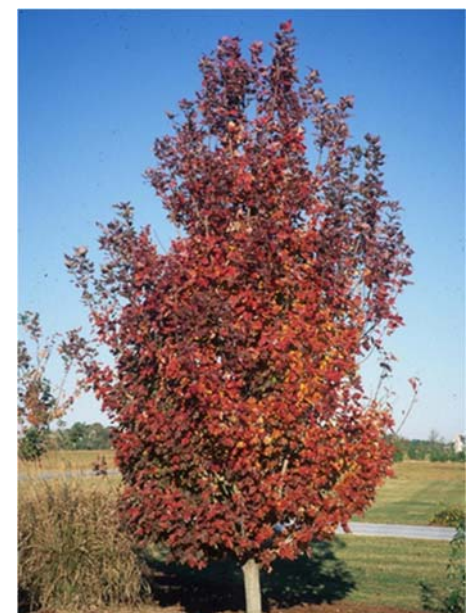
Figure 4: The slow-growing red maple (Acer rubrum).

White ash (composed mainly of the popular cultivated variety 'Autumn Purple') and green ash claimed the No. 5 and No. 6 spots, respectively. While ash were among the fastest-growing trees in this study, they are no longer recommended for planting because of the threat of the invasive pest emerald ash borer; see the emerald ash borer section below for more information.