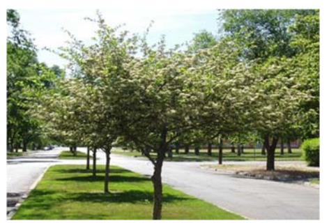
Figure 2: The hawthorn (Crataegus spp.) ranked as the slowest growing overall.

Overall, cottonwood, catalpa, white oak, silver maple and white ash grew most quickly in this semi-arid climate, each yielding more than 10 inches in diameter growth over the 24year period. White fir, red maple, hackberry, piñon and hawthorn were the slowest growers, adding 7.5 inches or less.