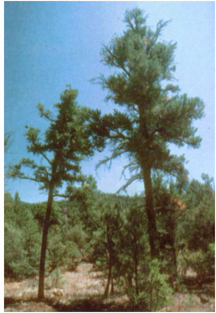
Figure 3. Witches' brooms on severely infected pinyon pines.

There are natural factors that affect the distribution of pinyon pine dwarf mistletoe, especially wildfires, which have been nature's primary control agent. Also, several species of insects and fungi may attack and kill pinyon pine dwarf mistletoe shoots or fruits.