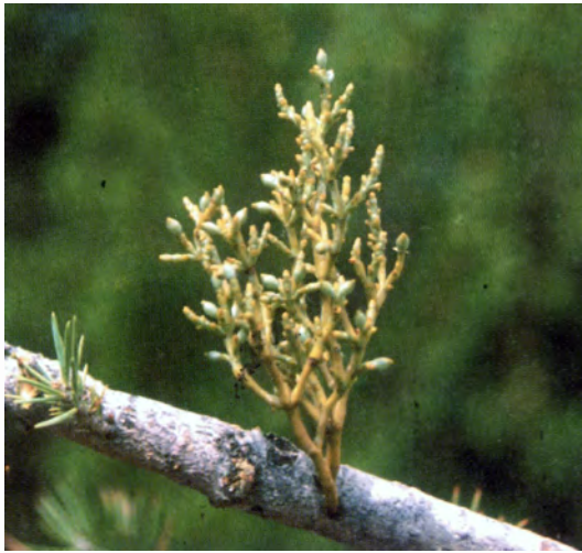
Figure 2. Female plants of pinyon pine dwarf mistletoe.

base of needles. Fastened in place on small branches when the viscin dries, seeds over-winter in a dormant state. Seeds are often destroyed by insects and fungi, or dislodged by rain and snow, so only a small proportion of those dispersed actually survive and cause new infections.