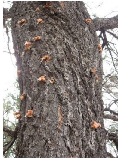
Figure 1. Piñon pines killed by Ips bark beetle (left). Pitch tubes on a piñon tree (right)

As a homeowner, there are a few management strategies available: