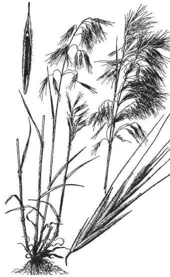
Figure 1: Illustration of cheatgrass. From USDA-NRCS PLANTS Database/Hitchcock, A.S. (rev. A. Chase). 1950. Manual of the grasses of the United States . USDA Misc. Publ. No. 200. Washington DC.

Cheatgrass is notorious for its ability to thrive in disturbed areas—common disturbances include construction, fire, floods, poor grazing activities, and intense recreation. But, it also will invade undisturbed areas. Cheatgrass is hard to control once it becomes established. As this invasive weed begins to dominate an area, it alters native plant communities and displaces native plants thus impacting wildlife. Additional negative impacts include changes in soil properties, a decline in agricultural