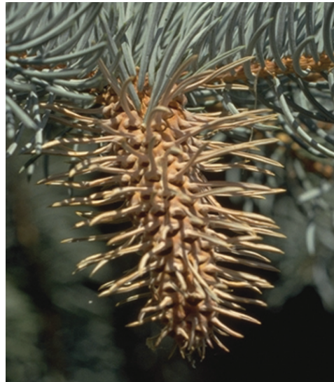
Figure 1: Gall on blue spruce.

The insects develop within chambers inside the galls and gradually increase in size. During the period when the insects are actively feeding, the galls stay green and are not readily observed. By midsummer, the galls dry out, the chambers open and