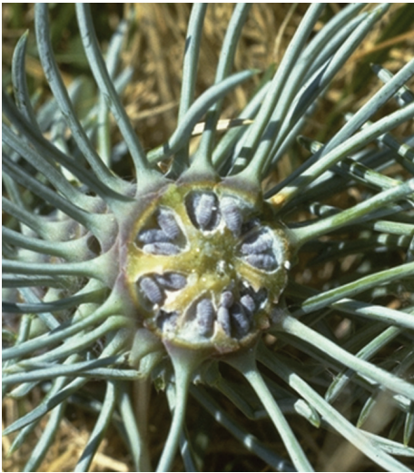
Figure 3: Gall cross-section showing developing insects.

that resistance to galling is a widespread characteristic among spruce trees.