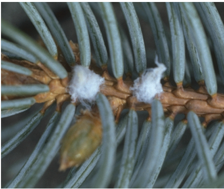
Figure 2: Overwintered females.