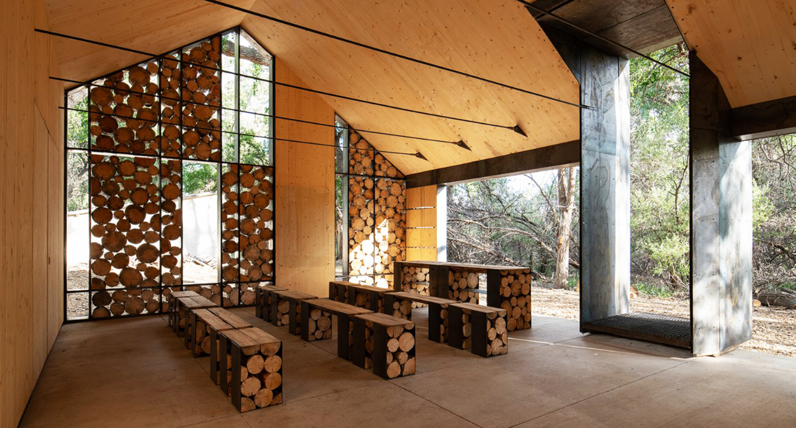
The Colorado Building Workshop partnered with the Colorado State Land Board to construct this outdoor classroom, made of mass timber from Colorado spruce, at Chico Basin Ranch.

applications for erosion control and bark or mulch for landscaping require larger populations for adequate market depth. The Front Range in Colorado might be an opportunity for these technologies, as approximately 84% of the state's population resides along or near the Rockies' eastern foothills (Colorado Department of Local Affairs, 2024).