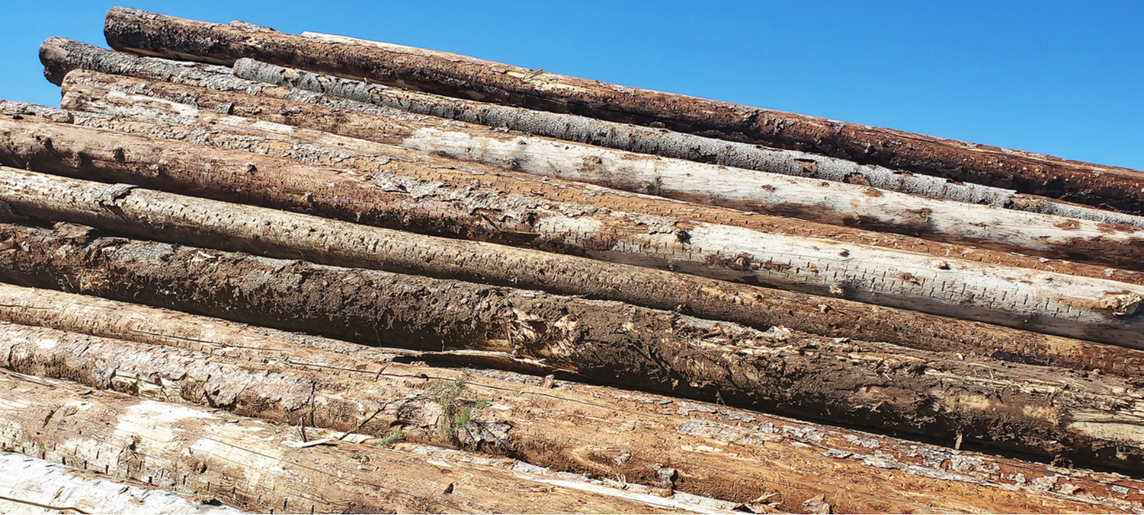
A stack of spruce logs waits to be milled.