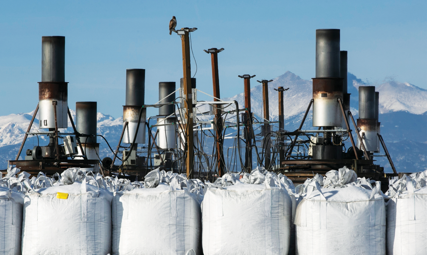
These kilns at Biochar Now's facility in Berthoud process Colorado timber into biochar via pyrolysis.

use of forest biomass as a biomass feedstock is a viable method for sequestering carbon, reducing fire risk and producing biochar. The byproducts of sawmills, or mill residues, are also a viable feedstock for pyrolysis.